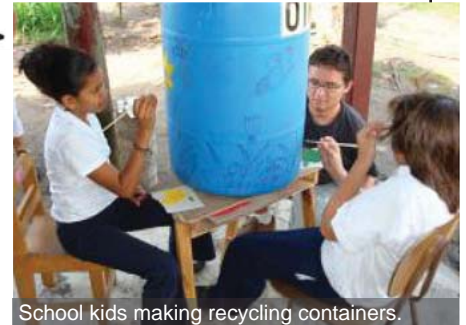
School kids making recycling containers.

recyclable, re-usable, compostable, and landfill trash. After seeing how much waste they produced just from their lunch, the students began to bring their lunch in re-usable containers such as Tupperware.