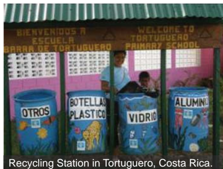
Recycling Station in Tortuguero, Costa Rica.

Last summer CCC was very busy with recycling activities to help reduce the amount of plastic waste. Beach clean-ups were only the beginning to a successful and ac-