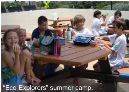
"Eco-Explorers" summer camp.

While the Eco-Explorers were learning about reducing their waste, school children in Tortuguero, Costa Rica, made their own recycling containers. CCC's Research Assistants spoke to the students about the need to reduce, reuse and recycle to help reduce the amount of trash in the community.