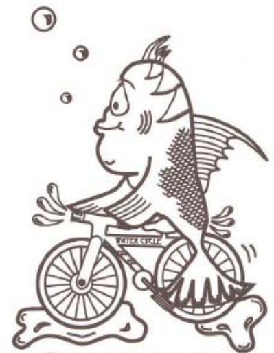
RoJo on his water cycle

From The Educator's Guide to Marine Debris , COSEE Publication, 2009